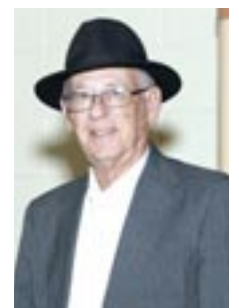
Below left: The final 4 in the run for the Grand Prize. At right is our Grand Prize winner!