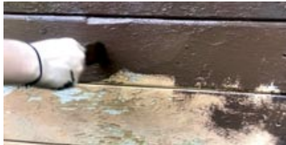
Pictured above left is the group of Youth from Holy Family who participated in our Mission Makeover! Pictured below left is a glimpse of how the boards around our deck looked before all the painting! We are so very thankful for these volunteers.