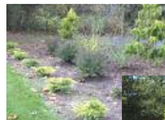
Above: the before. At right: the after.