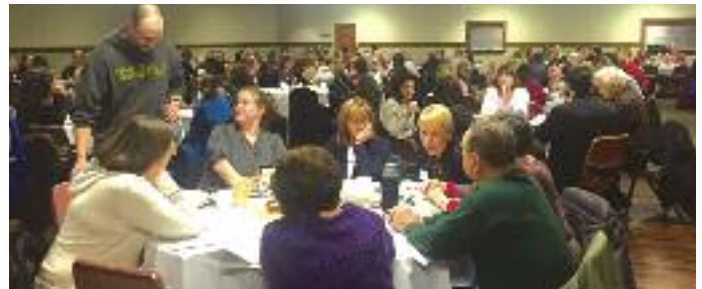
Spirit Filled Catholic Living seminar at St. John, Fenton.

A 6-week seminar given in parishes have brought a multitude of people into small group studies. The seminar’s focus is on understanding the Holy Spirits’ movement and discerning the charisms each have been given. Holy Family of Grand Blanc, and St. John in Fenton, have seen record numbers of parishioners attending and remaining in formation for months afterwards. St. John saw 250 persons each week for 6 weeks, while Holy Family saw 150 each week. Both parishes have numerous folks doing the follow up courses and staying in formation and intentional discipleship.