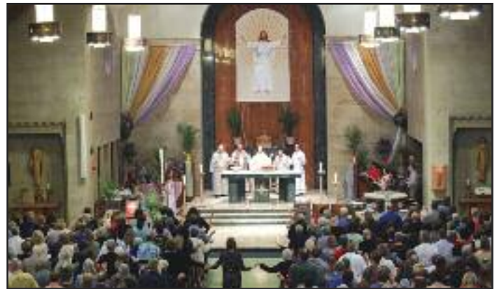
And all together we say, "Our Father who art..." and 1200 plus brothers and sisters in Christ.

was a glimpse into the Ministry of Healing. We served 2,500 people in 3 days at St. John, Fenton, Holy Family, Grand Blanc; and Holy Redeemer. At Fenton and Holy Family there were 12 clergy involved at each event. Some prayed with formed Prayer Ministers; 4-5 at a time served in confession lines of 35-45 people at a time and 25 more served in other ministerial capacities. These are 'our brothers and sisters'; these are 'God's people'; these are the 'wounded in the field.'