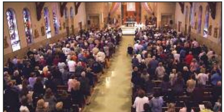
An overflowing church ... praise God!

was a glimpse into the Ministry of Healing. We served 2,500 people in 3 days at St. John, Fenton, Holy Family, Grand Blanc; and Holy Redeemer. At Fenton and Holy Family there were 12 clergy involved at each event. Some prayed with formed Prayer Ministers; 4-5 at a time served in confession lines of 35-45 people at a time and 25 more served in other ministerial capacities. These are 'our brothers and sisters'; these are 'God's people'; these are the 'wounded in the field.'