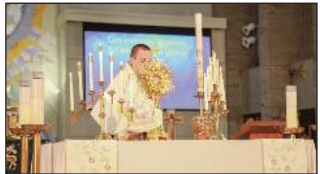
He is present, our Redeemer and Healer.