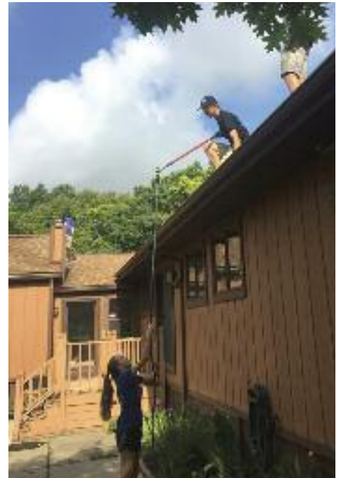
A few brave souls spent some time cleaning the gutters & putting on gutter screens.

“As someone who has just graduated from high school, I was looking forward to the impacts I could make in the greater community before heading off to school in the fall. Volunteering on this mission trip provided me with a week of friendship, learning, prayer, and giving to the St. Francis Prayer Center. After many hours of work in the sun, I left having learned new skills such as sanding wood, repairing a deck, using paint stripper, and trimming many, many trees. I am thankful for the opportunity to impact the Flint community and to have helped rebuild a beacon of light to the people who live there.”