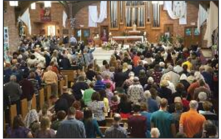
Beyond capacity ... God's people came.