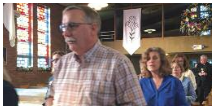
Spirit Filled Catholic Living seminar at Holy Family, Grand Blanc.