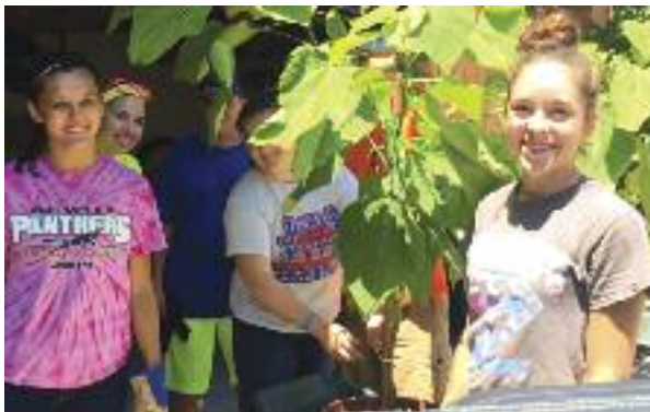
A few of the youth spent some time planting, weeding, and repotting plants.