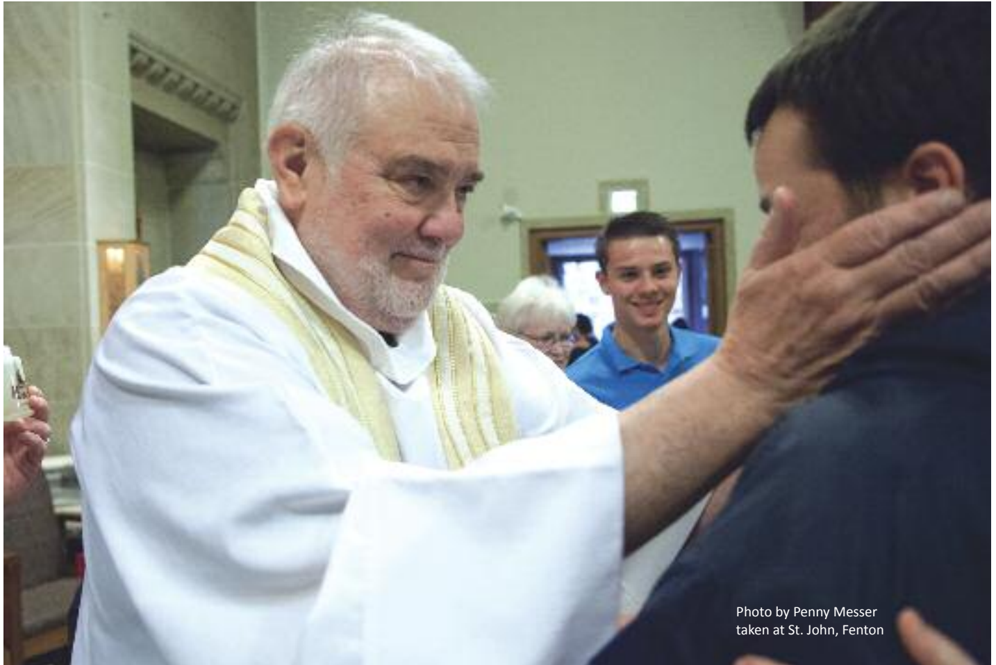
taken at St. John, Fenton