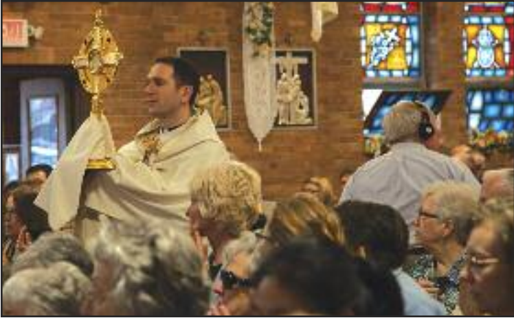
Jesus of Nazareth is walking among us.