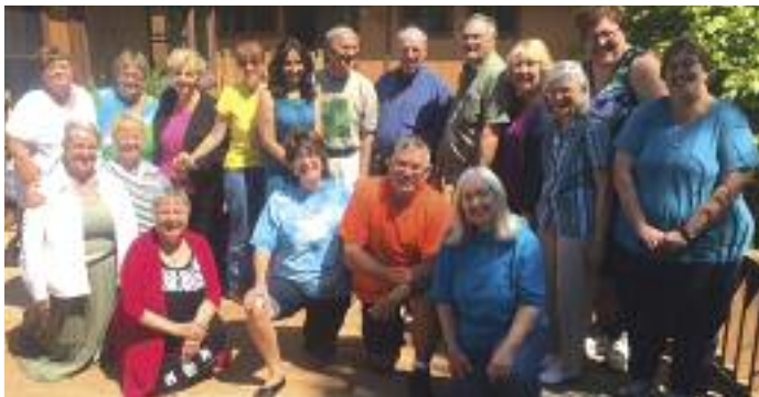
A recent class held @ St. Francis Prayer Center.

Pilgrim’s Way continues to bring people closer in relationship with Jesus and gives way to new thoughts of ways to live our faith. The study has brought in well over 300 people since September 2012. Formational in nature, a large majority still continue on in the follow-up programs of Shepherd’s Healing, Listening, and others; keeping 50-75 people always in motion. New classes are targeted for the fall; possibly one for married couples.