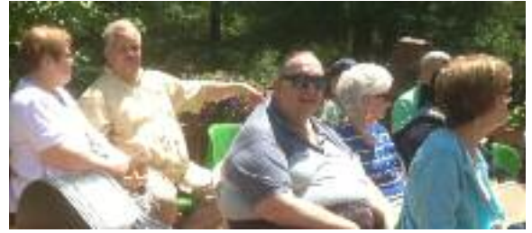
Pictures of participants from last year.

Weather permitting, we will eat outdoors and enjoy the gardens and the wonders of God.