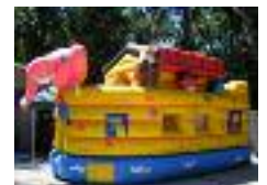
Bounce House for Kids (Not actual one pictured.)