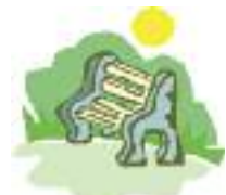
Benches for Relaxation

•People will be fed physically & spiritually, •There will be blessings for children as they return to school.