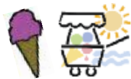
Ice Cream Cart

Come for a musical, spirit-filled, community-minded, fun-filled event!