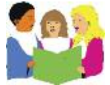
Singing & Playing